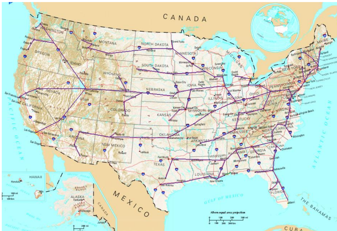
Possible Routes for the Carbon March to DC

Regarding the march’s route, unlike the Salt March, the Carbon March to DC could have multiple starting locations, with each of these timed so that they’ll all converge in Washington on the same day. (See below map.)