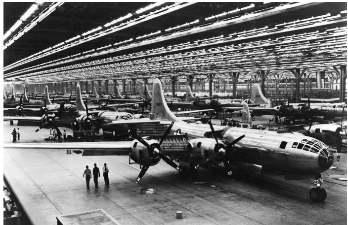
The flow of output: a B-29 assembly line in 1944.

Over the years, conventional economics has been critiqued several times in light of thermodynamics. One critique came from another Nobel-lau- reate chemist, the Englishman Frederick Soddy. In the 1920s and 1930s he produced a series of books developing the idea that an economy is, at bot-