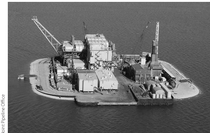
Joint Pipeline Office

An agreed-upon standard for the boundaries of EROI analysis would al-